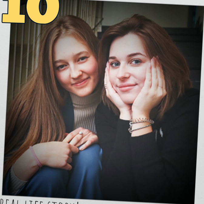
REAL LIFE STORY! Girlsday's backstage 💕💕