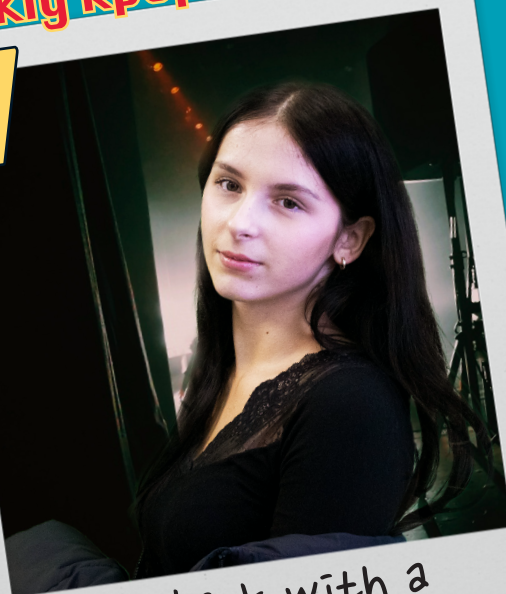
CiNC is back with a global concert schedule!